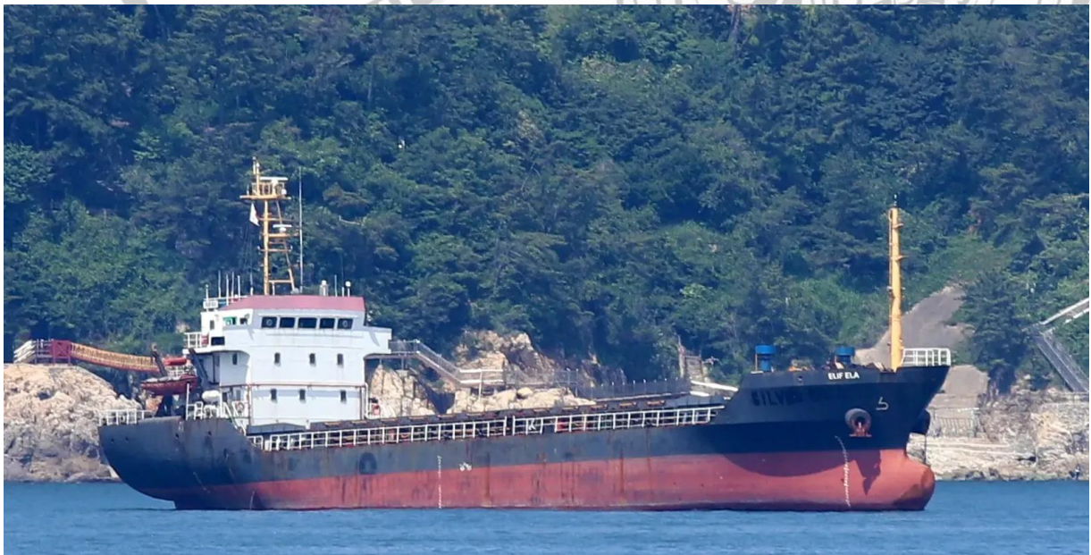
Picture of the ship