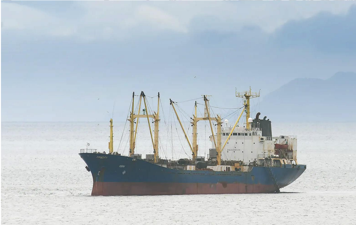
Picture of the ship