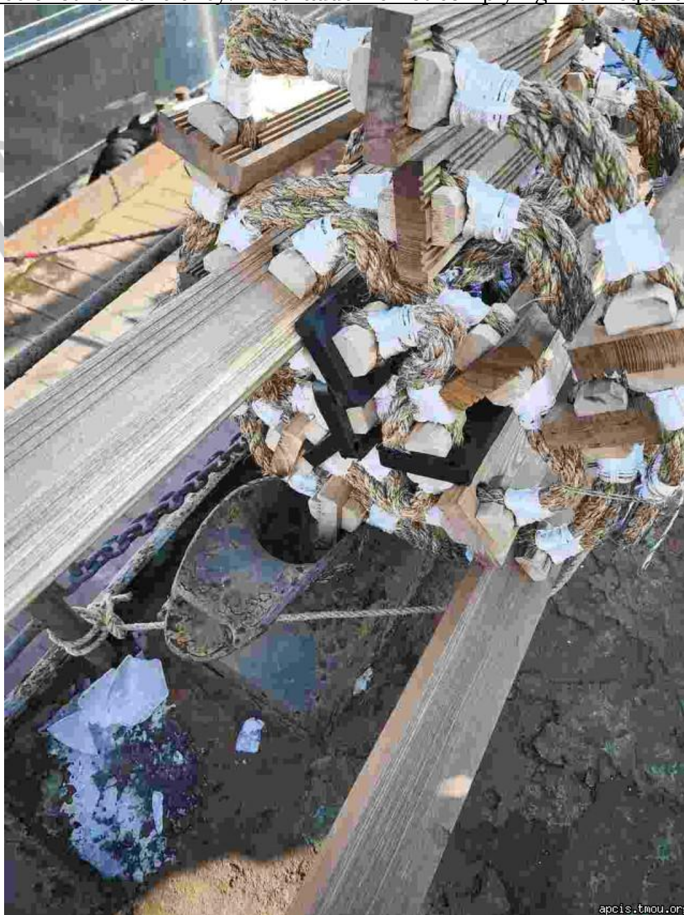
Pictures of other deficiency: Pilot ladder is not complying with requirements.